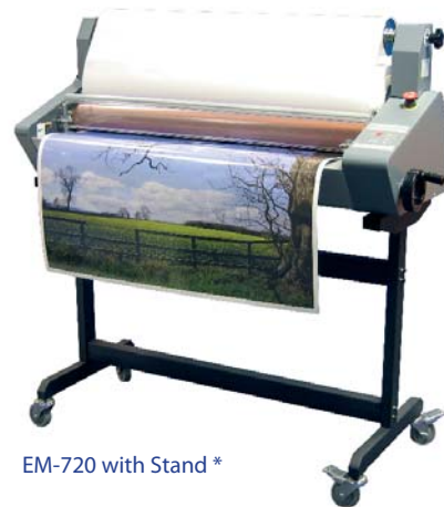
EM-720 with Stand *