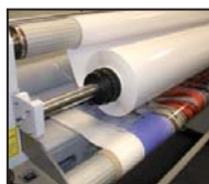
MOTORISED TAKE UP UNIT*