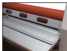
LARGE SWING OUT FEED TRAY