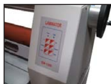
USER FRIENDLY CONTROL PANEL